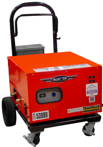
4 Wheel Cart