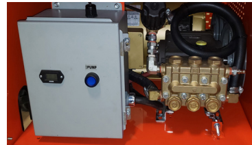
Photo Inside Model 530BD