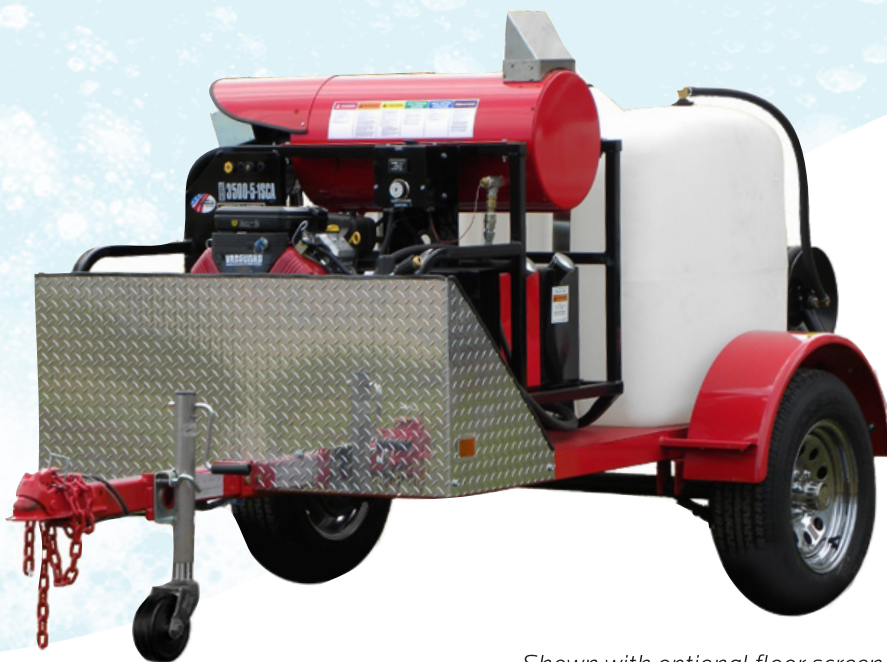
Shown with optional floor screen guard and front rock guard