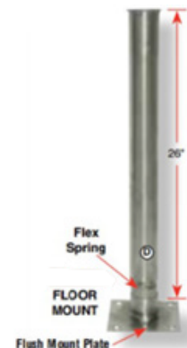
Floor Mount Wand Holder