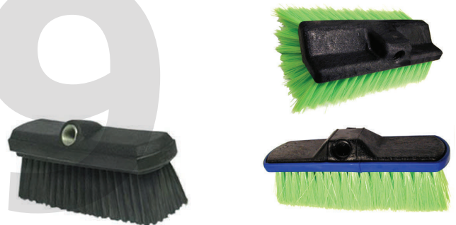
Foaming Brush Part# J06-00360