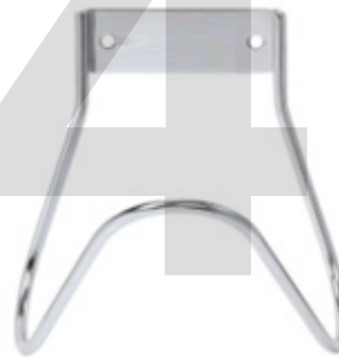
Hose Hanger SS