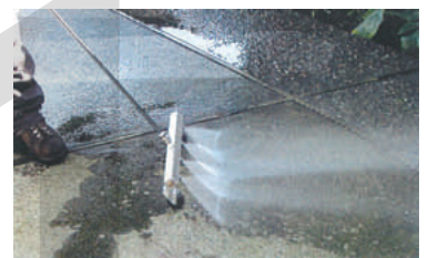
16" in action